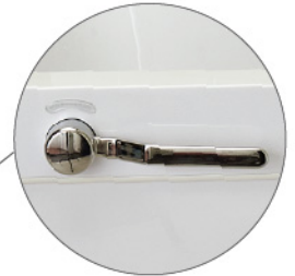
2 LATCH DOOR