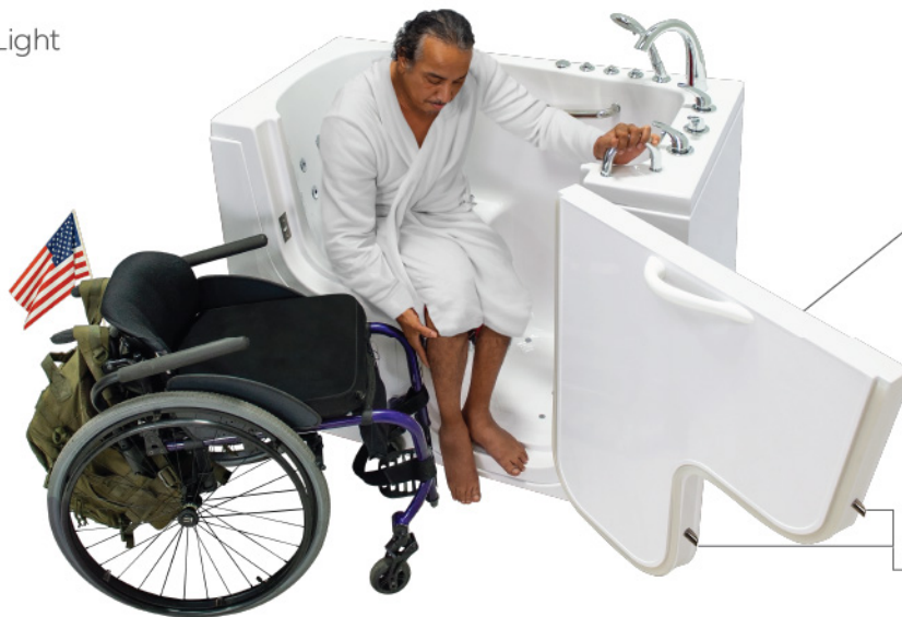
GEAR & SHAFT SYSTEM